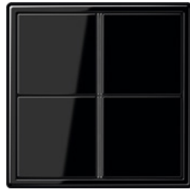
F 40 sensor, 4-gang