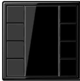
F 50 sensor, 4-gang