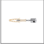
C5 Fastener Ref: 42107