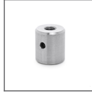
Transverse hook Ref: 1504