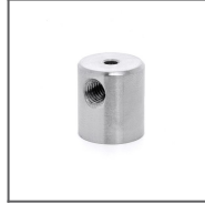
Longitudinal hook Ref: 1505