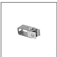
HR-OPTI Mounting bracket Ref: 42121