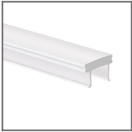
HR-21 frosted Cover Ref: 17152