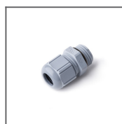
M16 x 1.5 Gland Ref: 42271