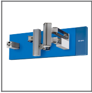
Foam 70570 Ref: 70570