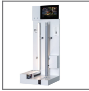
Display P230-90223M Ref: 90223M