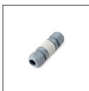
Hermetic coupler Ref: 42702