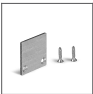
HR-OPTI-STN End cap Ref: 24387