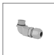
M16 x 1,5 - L90 Angular gland Ref: 42289