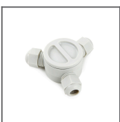
Hermetic splitter Ref: 42703