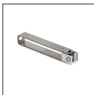
HR-OPTI-A Mounting bracket Ref: _