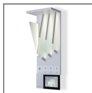
Display P230-90177M Ref: 90177M