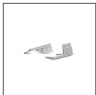
KRAV-05IN grey End cap Ref: 24308