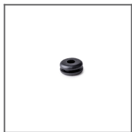
6.4 x 1.6 Gland Ref: 00802L