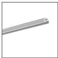
PIKO-O Profile Ref: C1167