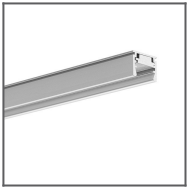
REGULOR Profile Ref: B468+43