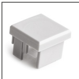
END CAP M-K 24216